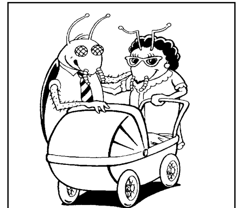
They're so tiny now! But by tomorrow they'll be crawling all over someone else's house!

Proper identification is important, because the control techniques we use are very different for termites, carpenter ants, and other ants. Call us for a professional inspection if you find any of these pests in or near your home. Save some of the pests for us in a jar for proper identification, but please don't fill the jar with water—it rots insects. Whatever the pest, we'll design the best control strategy to eliminate them.