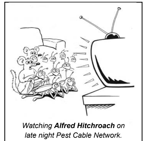
Watching Alfred Hitchcock on late night Pest Cable Network.

Weather-stripping does more than just keep out cold air—it can also reduce the number of pests coming in. Apply new (or replace old and brittle) weather-stripping around all exterior doors, including garage doors, as well as to any gaps around windows and other openings.